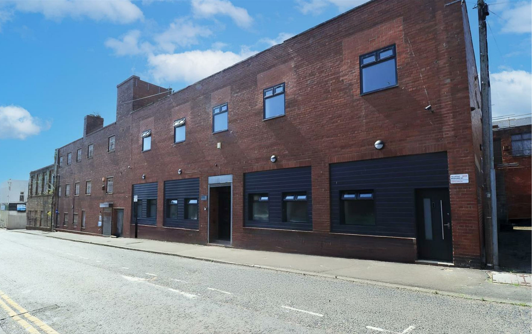
📍 Little Bedford Street, North Shields NE29 6NW